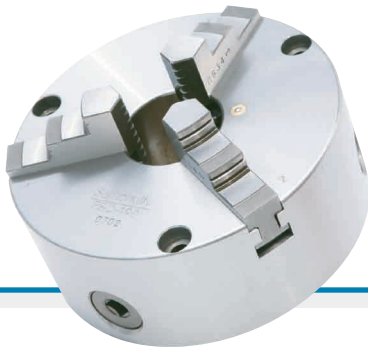
Front-mounting 1-piece jaw scroll chuck (incl. internal and external jaws)